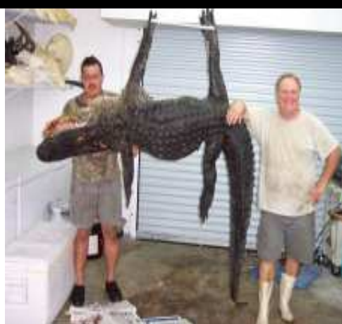
With a Seaweed 600 lb test line