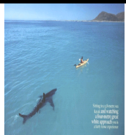
Shark vs kayak