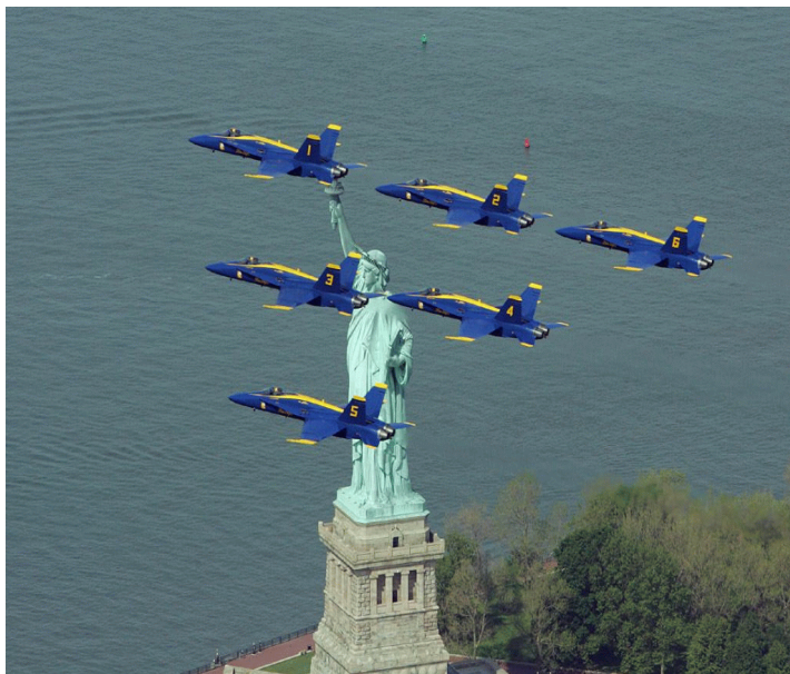
Navy Fly-by Memorial Day 2006